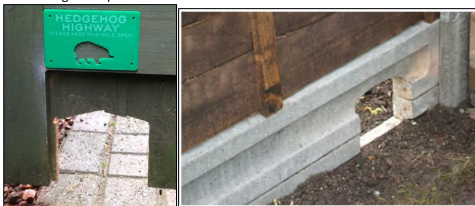
Figure 19.1 Examples of Hedgehog highways' that can maintain habitat connectivity for hedgehogs in residential developments