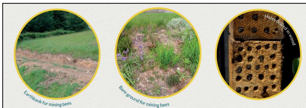
Figure 19.2: Example of solitary bee habitat. Extracted from How-To-Guide: Creating Wild Pollinator Nesting Habitat (NBDC, 2016)

Large bee or insect hotels will not be installed. Guidance from the All-Ireland Pollinator Plan states “Don’t install a large bee or insect hotel. Large bee hotels are attractive to humans, but not great for pollinators. They can encourage the spread of disease and attract predators. Avoid anything bigger than an average-sized bird box. There are many other ways to provide nesting habitats for pollinators, such as providing wild areas of undisturbed long grass, and scraping back some bare earth. If you want to make a bee hotel, make sure it is small, and position it away from bird feeders so the insects aren’t easy targets.” A link to a “How-to-guide Creating wild pollinator nesting habitat” is provided for the development management company to put these habitats in place: Pollinator-Nesting-How-to-Guide-2022-WEB.pdf ( pollinators.ie ). An appointed ecologist will oversee the creation of these habitats.