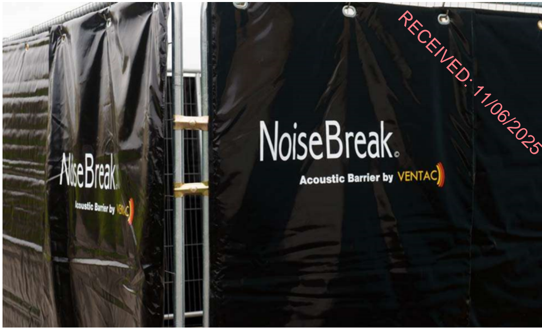
Figure 19.3: Temporary Construction Noise Barrier